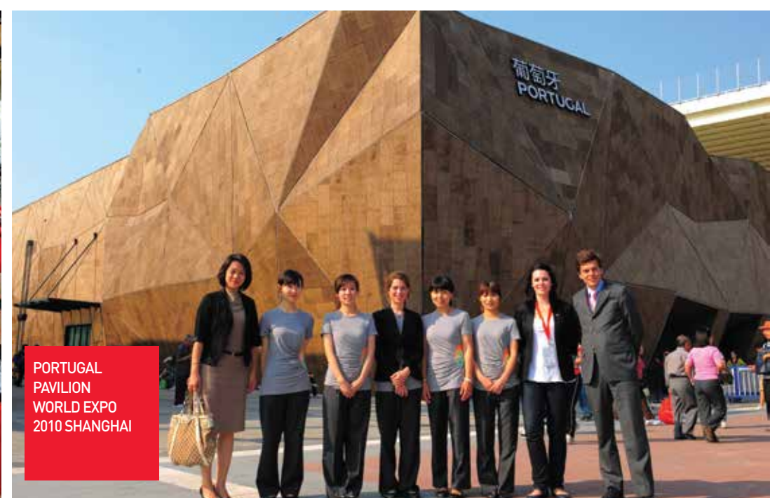
PORTUGAL PAVILION WORLD EXPO 2010 SHANGHAI