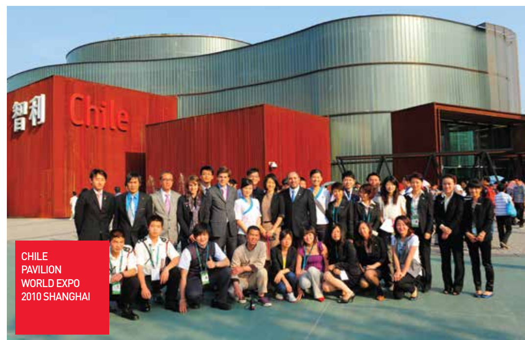
CHILE PAVILION WORLD EXPO 2010 SHANGHAI