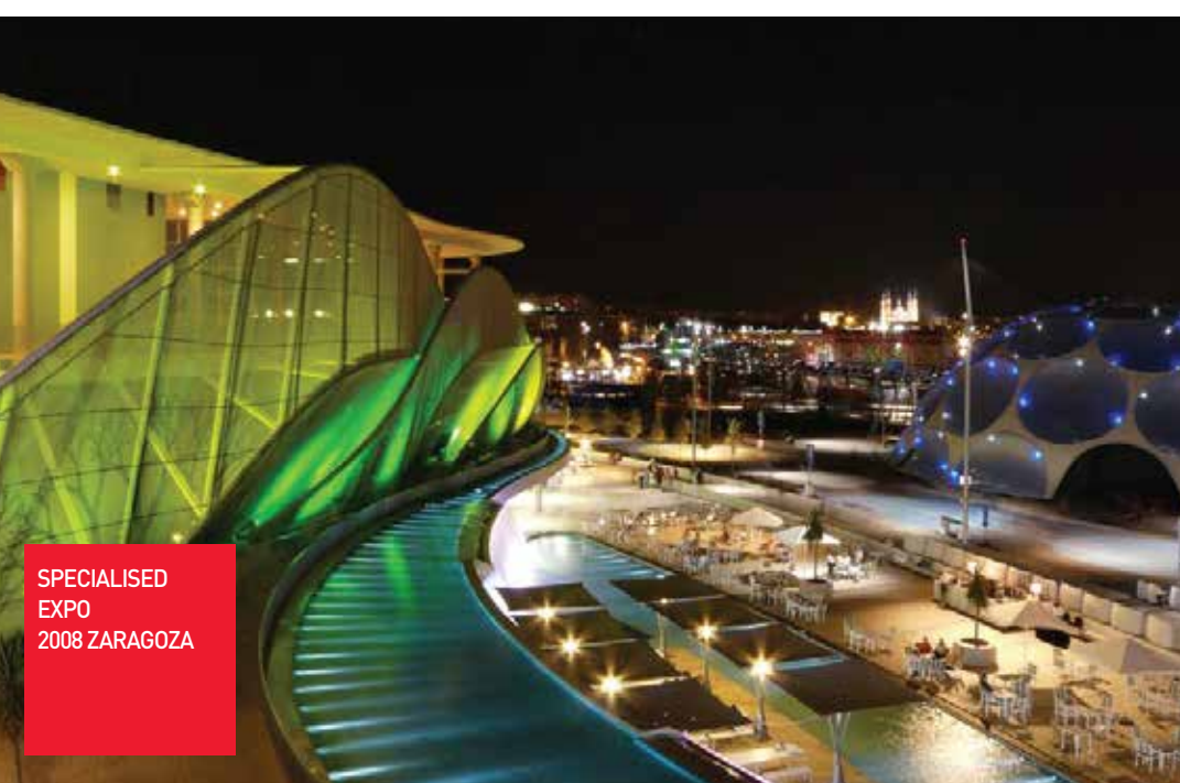
SPECIALISED EXPO 2008 ZARAGOZA