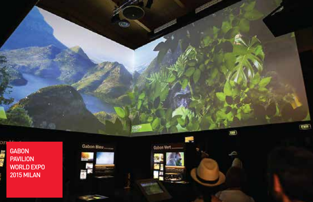
GABON PAVILION WORLD EXPO 2015 MILAN