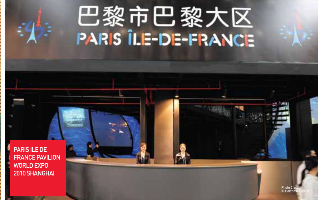
PARIS ILE DE FRANCE PAVILION WORLD EXPO 2010 SHANGHAI