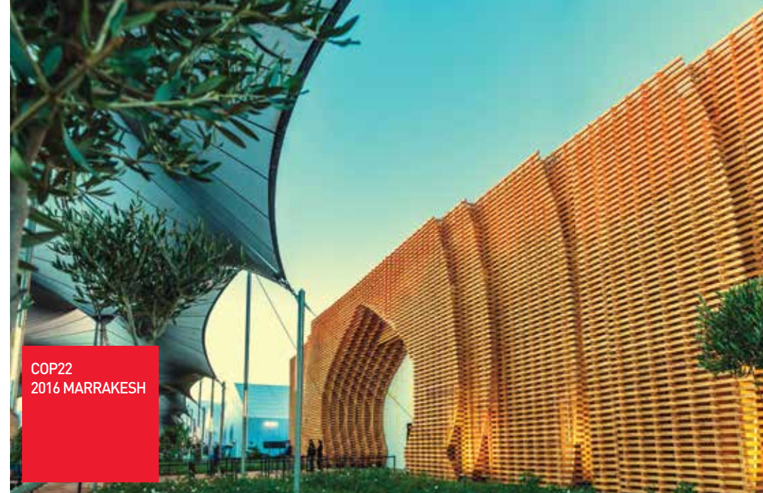
COP22 2016 MARRAKESH