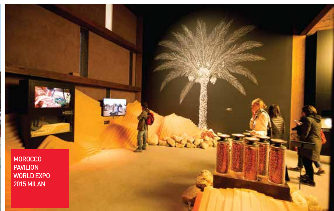
MOROCCO PAVILION WORLD EXPO 2015 MILAN